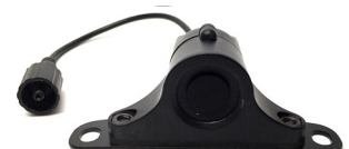
(4) Flange-Mount Sensors