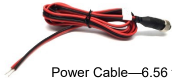
Power Cable—6.56 ft.